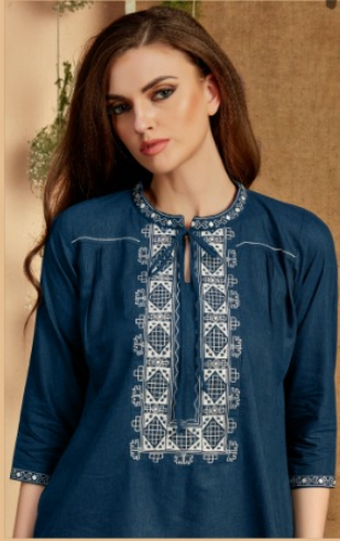
Dark Glamour Persian Blue Top with light gathers on the shoulders adorned with cream coloured thread embroidery.