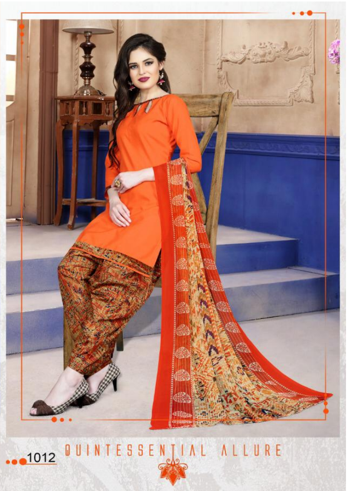
1012 QUINTESSENTIAL ALLURE