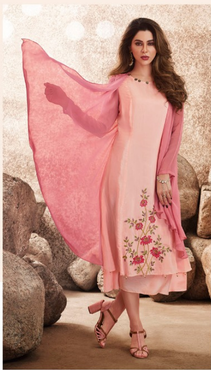
309 CONFORMING TO GOOD TASTE