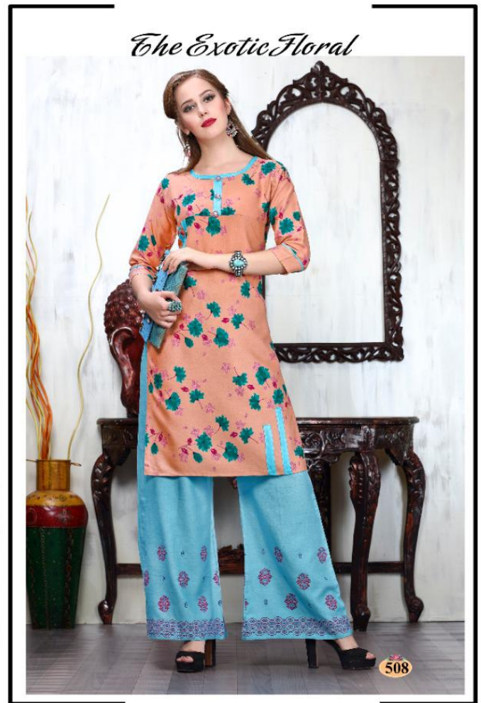
The Exotic Floral