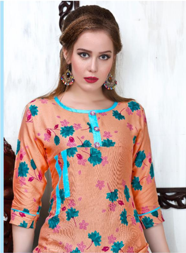
CHARM Majestic shade bright colour is one of the strongest fashion statement of the season and bold design fashion a more ethereal and exotic elect.