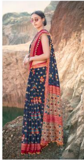
W T -03