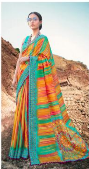
W T -09