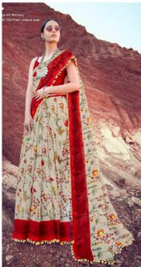
W T -05