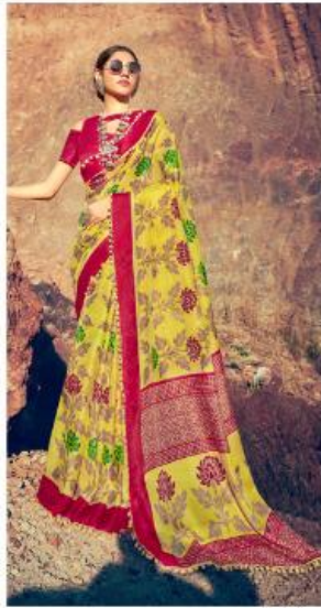
W T -02