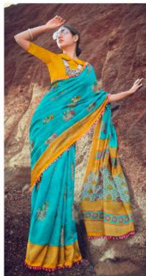
W T -11