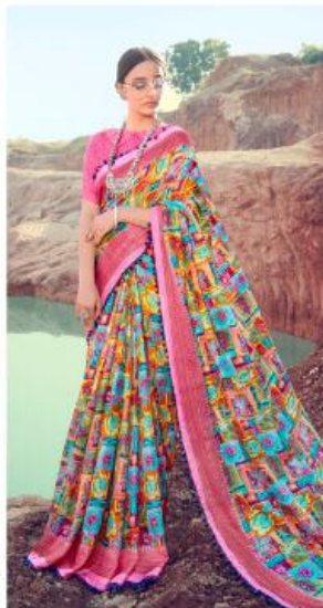
W T -06