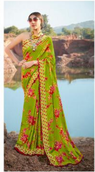
W T -04