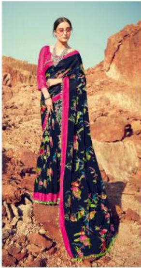
W T -01