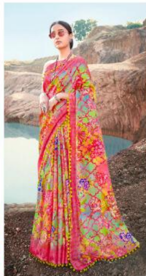
W T -07