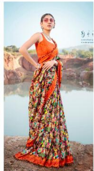
W T -08