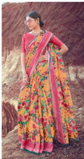
W T -10