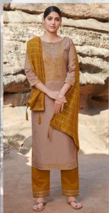
D No :- 2762