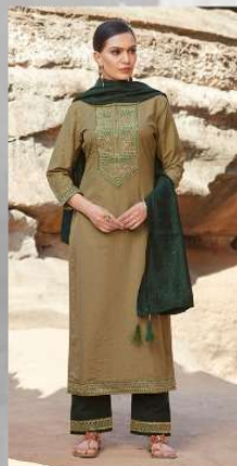
D No :- 2764