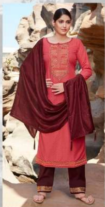
D No :- 2761