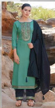
D No :- 2763