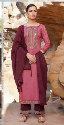
D No :- 2766