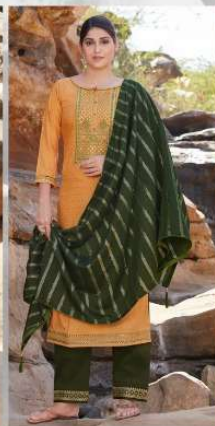
D No :- 2765