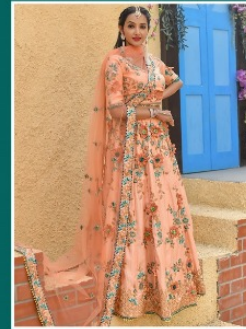
D.N. : 997