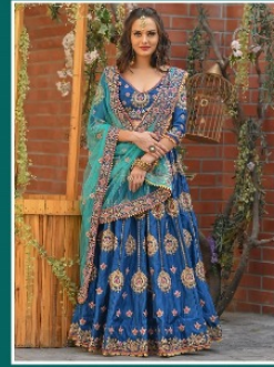
D.N. : 994