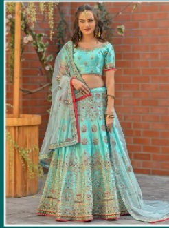
D.N. : 993