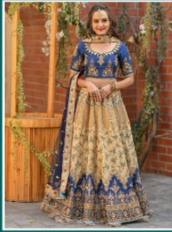
D.N. : 992