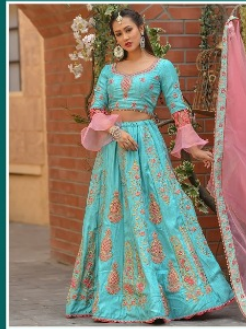
D.N. : 996