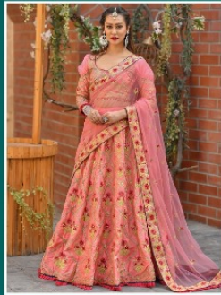
D.N. : 995