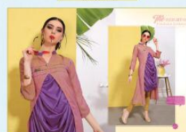
D. No. 1005