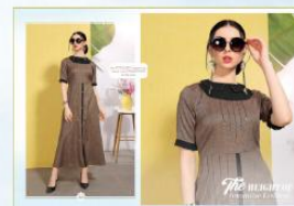
D. No. 1001