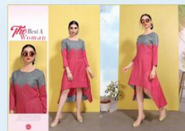
D. No. 1004