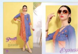
D. No. 1008