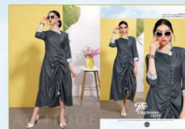
D. No. 1002