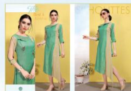
D. No. 1007