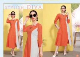
D. No. 1006