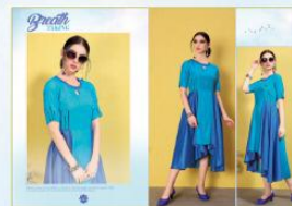
D. No. 1003