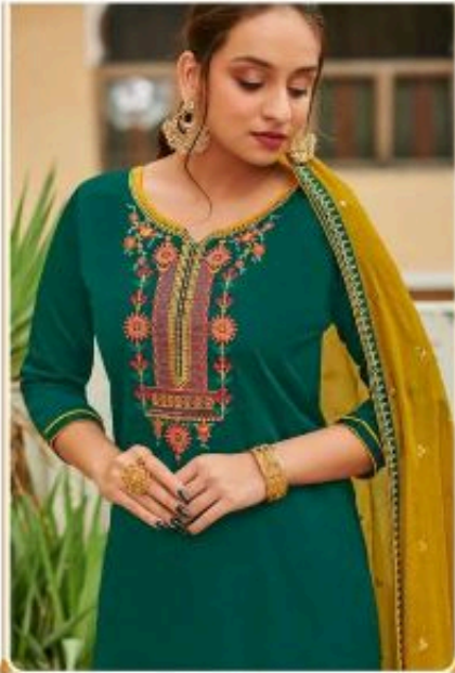
The accompanying design for the jacket consists of a full-length garment with a wide collar and a long, flowing dupatta.