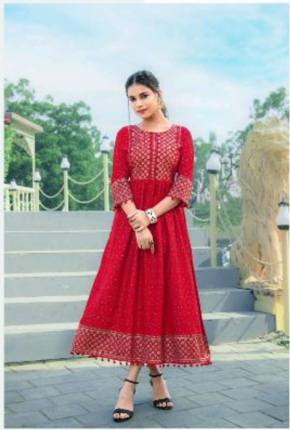
the height of feminine fashion, exuberant, elegant, stylish & graceful and exceptionally