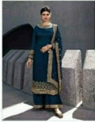
( 12122 )