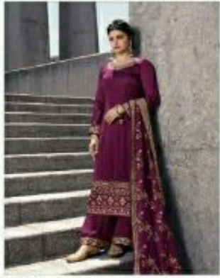
( 12121 )