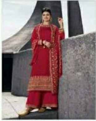
( 12123 )