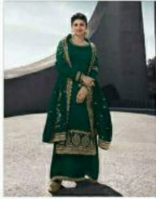
( 12124 )