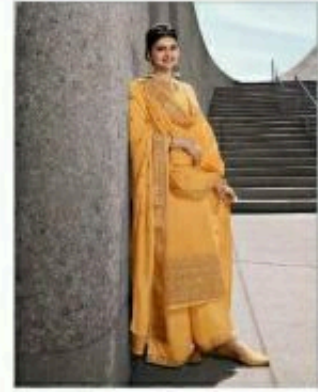
( 12126 )