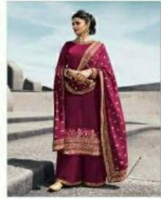
( 12125 )