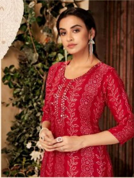
THIS SHAWL-ARMED KURTA BRINGS YOUR WARDROBE TO ITS GREATEST OF ALL-TIME COLOUR & CRAFTSMANSHIP