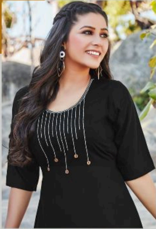
This dress and you are a match made in heaven. When you dress in this sublime creation, you transcend to a new pedestal.