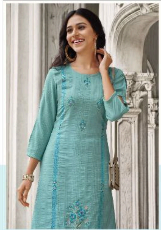
A FEMINE FUSION OF MODERNITY IN LIGHT WEIGHT FABRIC FLOWERS AND PASTEL COLOR