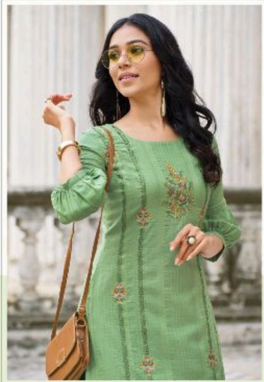
A COMBINATION OF FLORAL AND GEOMETRIC MOTIFS IN PINK TIPS OF BOUTIQUE LIGHTWEIGHT AND SOFTEN