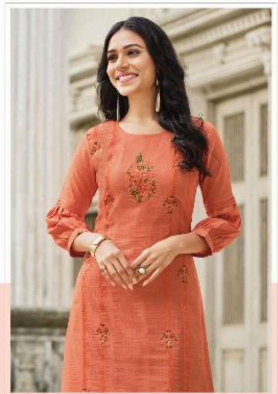
A TRENDING TIE-DYE EFFECT IN SUBTLE GOLDEN JEK WITH TRIPOLI BENT OF NEARBY 21-8121M