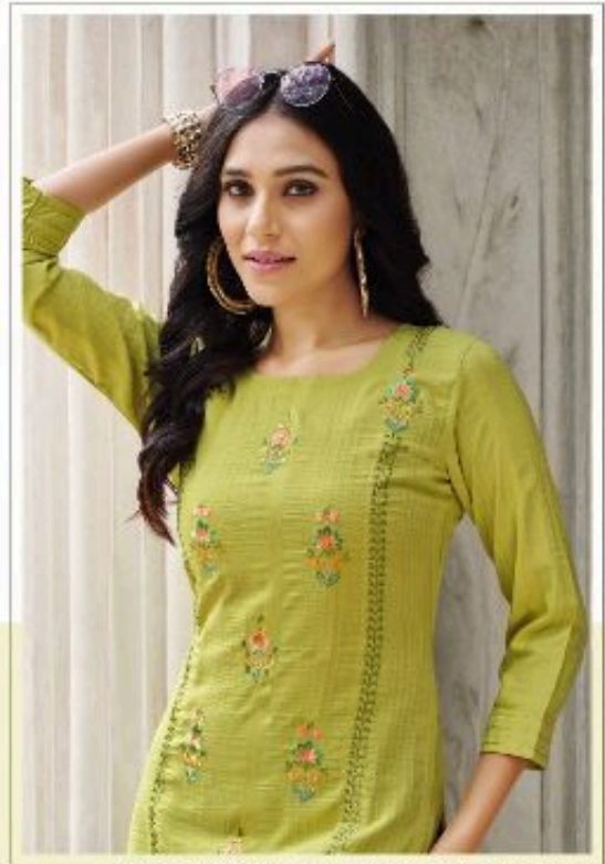
GREY AND YELLOW WILL BE THE COLORS OF THE YEAR. THE COMFORT FABRIC ARRANGEMENT IS OUR GO-TO STYLE THIS SEASON.