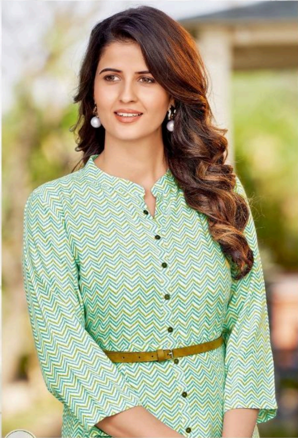
On trend yet steeped in heritage, this off-white sari is homage to today's style maven. .....◆.....