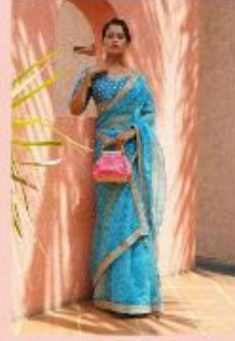
D. No. 3287 E