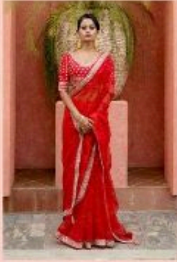
D. No. 3287 A