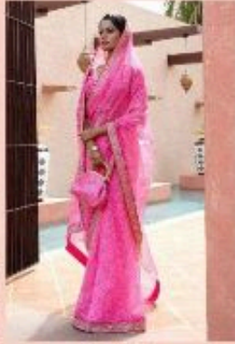
D. No. 3287 B