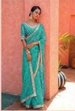
D. No. 3287 C