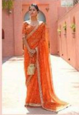
D. No. 3287 D