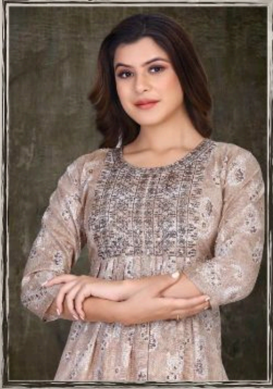
106 CHARMING DIVA