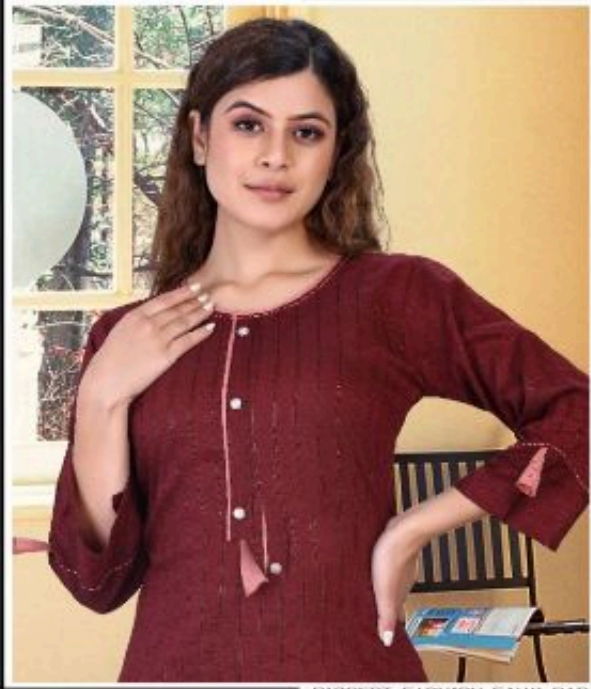
BIGGEST FASHION FAUX PAS

The woman is the most perfect doll that I HAVE EVER MET WITH DELICATE AND ROMANTICAL