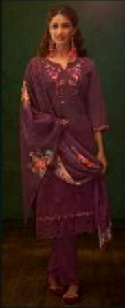
NO | 1652