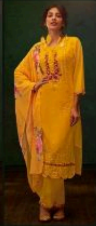
NO | 1653