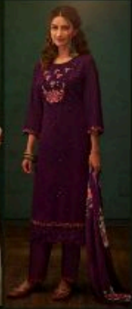
NO | 1656