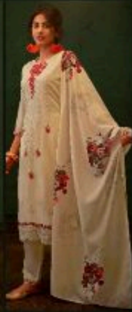
NO | 1655