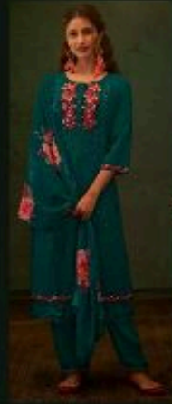
NO | 1654