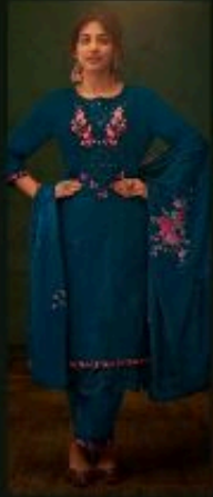
NO | 1651