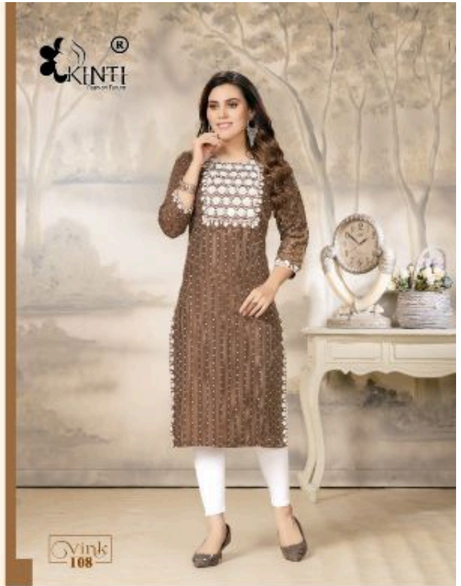
these are trends styles of women apparel that are more popular than the others.