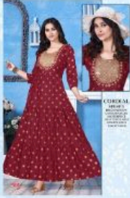
CORONAL 100% Cotton Length: 110 cm Bust: 36 cm Waist: 30 cm Hem: 100 cm