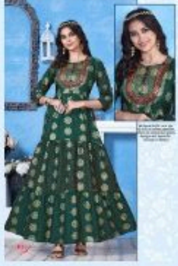
Crystal 100% Cotton Length: 110 cm Bust: 36 cm Waist: 30 cm Hem: 100 cm