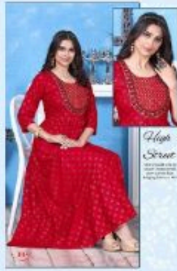
High Street 100% Cotton Length: 110 cm Bust: 36 cm Waist: 30 cm Hem: 100 cm