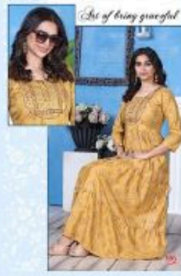
Art of being graceful