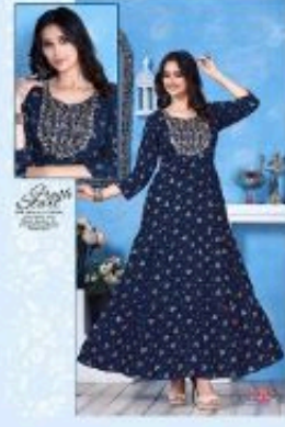
Grace 100% Cotton Length: 110 cm Bust: 36 cm Waist: 30 cm Hem: 100 cm