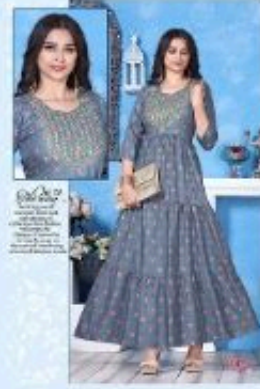
GRACE 100% Cotton Length: 110 cm Bust: 36 cm Waist: 30 cm Hem: 100 cm