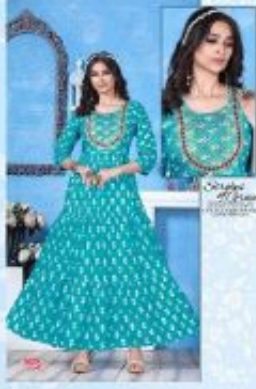
Crystal 100% Cotton Length: 110 cm Bust: 36 cm Waist: 30 cm Hem: 100 cm