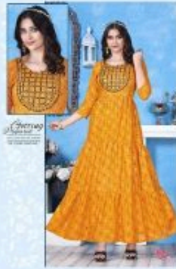
Cherry 100% Cotton Length: 110 cm Bust: 36 cm Waist: 30 cm Hem: 100 cm