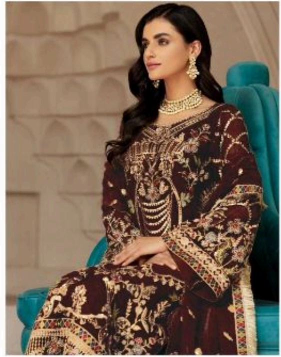
D.NO.130-C TOP:- GEORGETTE INNER:- SANTOON BOTTOM:- SANTOON+ PATCHWORK DUPATTA:- NAZNEEN