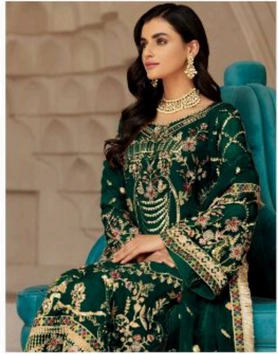
D.NO.130-A TOP:- GEORGETTE INNER:- SANTOON BOTTOM:- SANTOON+ PATCHWORK DUPATTA:- NAZNEEN