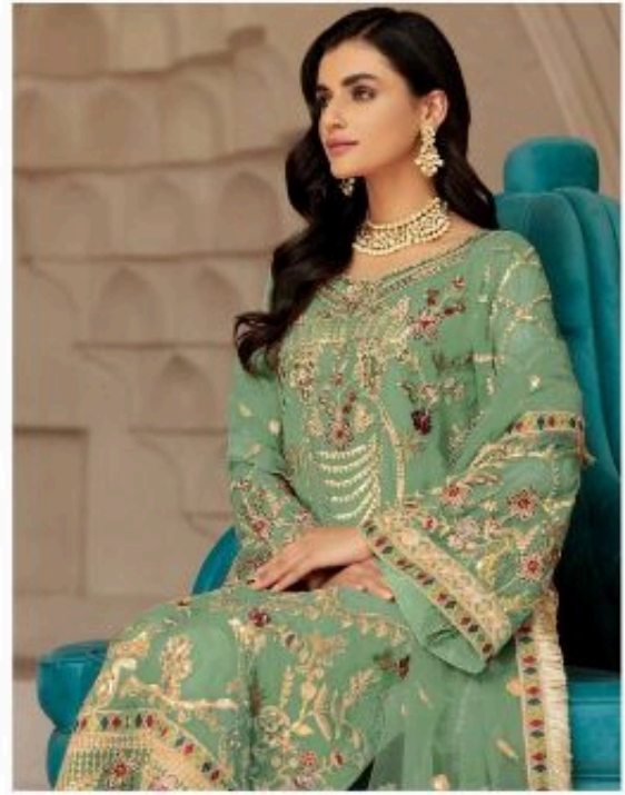
D.NO.130-B TOP:- GEORGETTE INNER:- SANTOON BOTTOM:- SANTOON DUPATTA:- NET