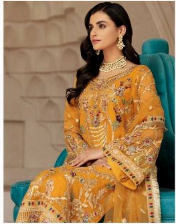
D.NO.130 TOP:- GEORGETTE INNER:- SANTOON BOTTOM:- SANTOON DUPATTA:- NET