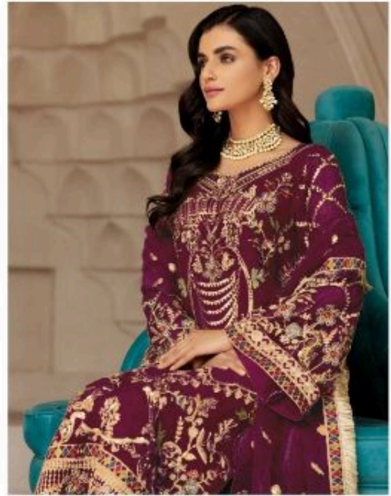
D.NO.130-D TOP:- GEORGETTE INNER:- SANTOON BOTTOM:- SANTOON+ PATCHWORK DUPATTA:- NAZNEEN