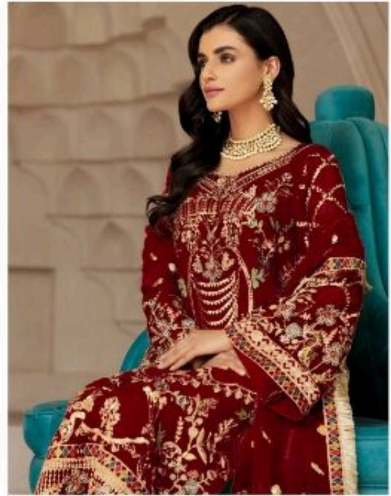
D.NO.130-E TOP:- GEORGETTE INNER:- SANTOON BOTTOM:- SANTOON+ PATCHWORK DUPATTA:- NAZNEEN