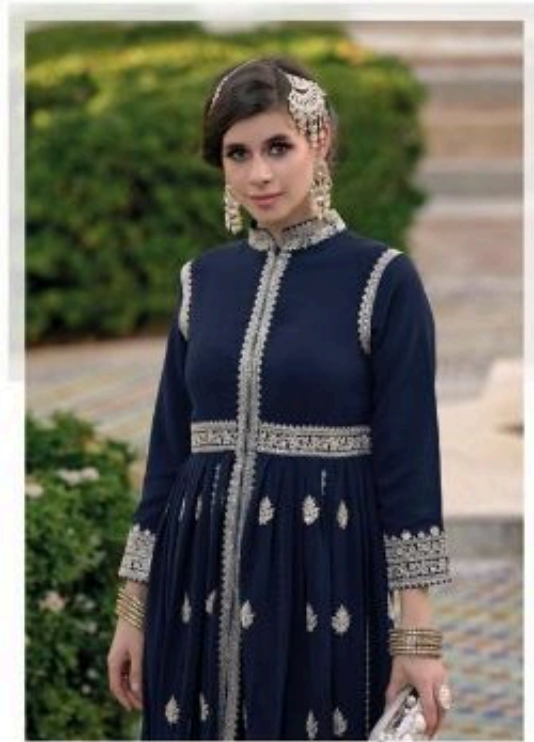
The difference between style and fashion is quality.