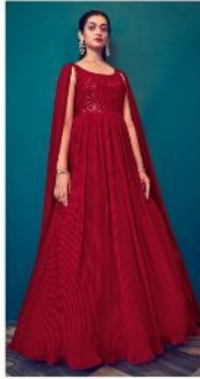
CODE + 4962