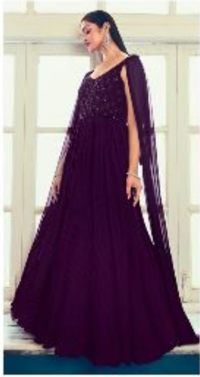
CODE + 4961