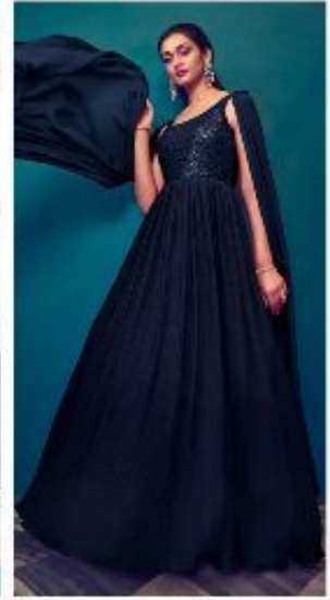
CODE + 4964