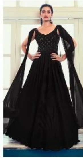
CODE + 4963