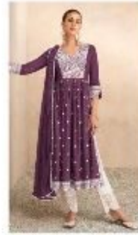
❖ 1106-E ❖