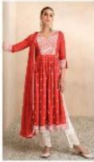
❖ 1106-A ❖