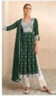
❖ 1106-B ❖