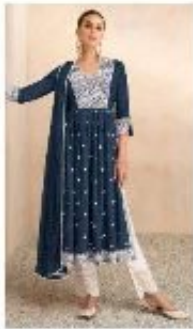
❖ 1106-C ❖