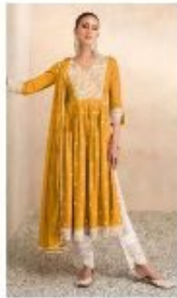
❖ 1106-D ❖

VAMIKA THE FASHION LIAISON AADHIRA VOL-4