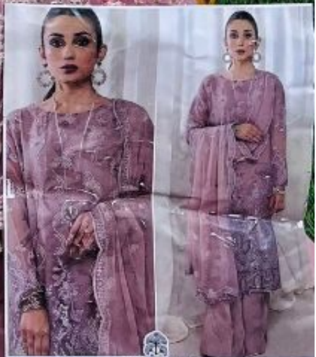
AFREEN-1 ZAHA D.No.10140 TOP: Full length with Embroidery BOTTOM: PINK, Full length Model: with Embroidery