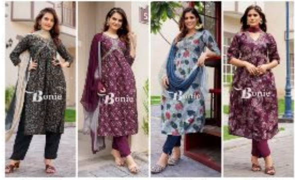
D.NO. 2001 D.NO. 2002 D.NO. 2003 D.NO. 2004