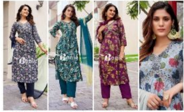
D.NO. 2005 D.NO. 2006 D.NO. 2007