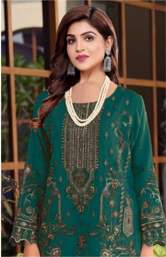
D.NO. - 56098-A 19035