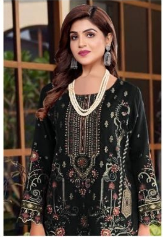
D.NO. - 56098-B