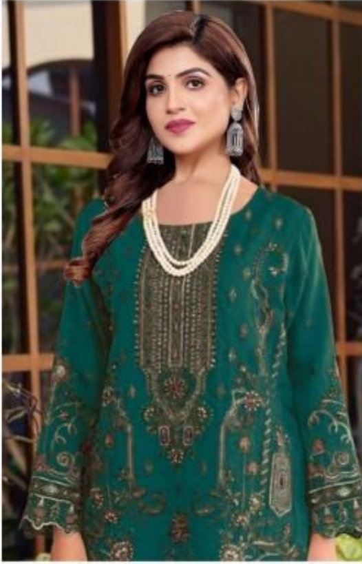
D.NO. - 56098-A 19035