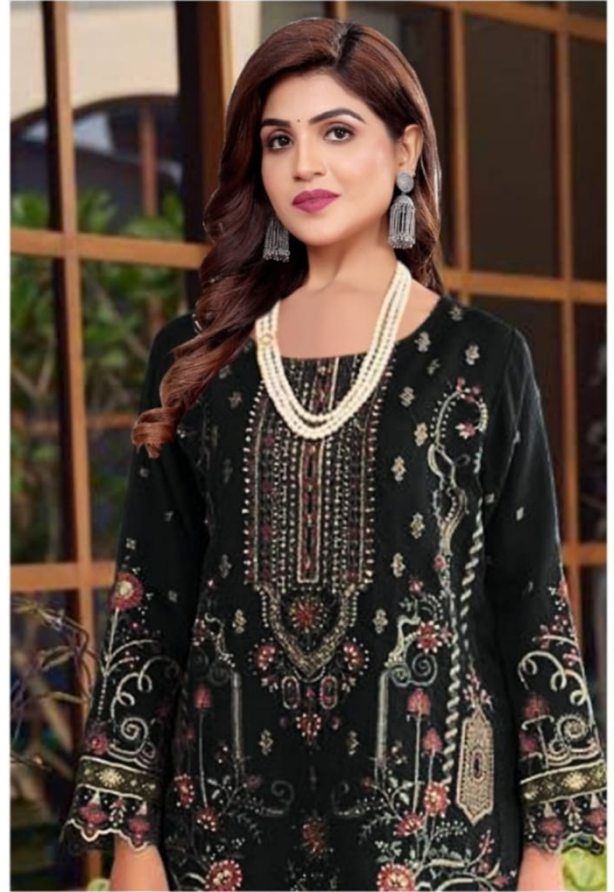
D.NO. - 56098-B