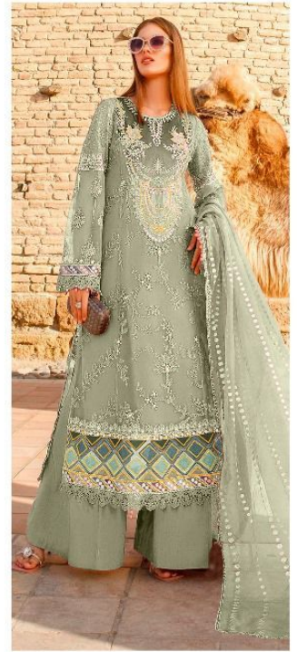
C -1343 D