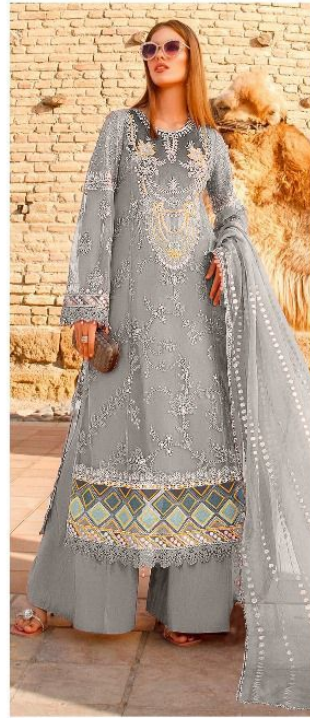
C -1343 C