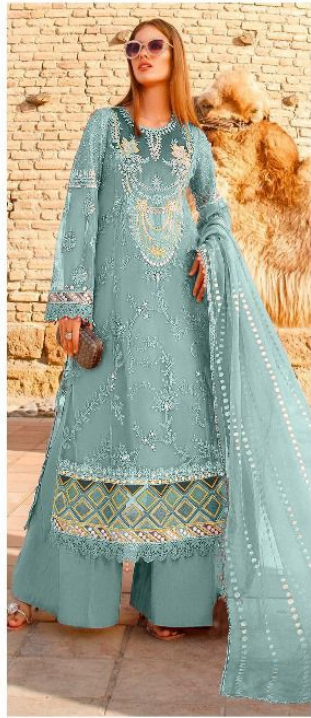
C -1343 B