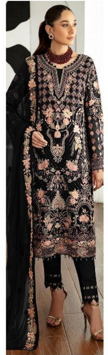
D.NO.162 - D