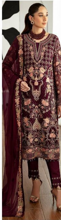
D.NO.162 - A