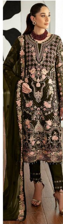
D.NO.162 - B122111 D.NO.162 - C