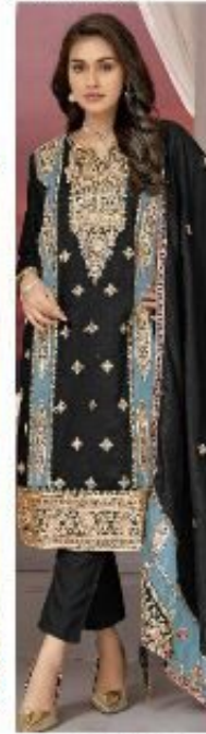
D.NO.168 - C