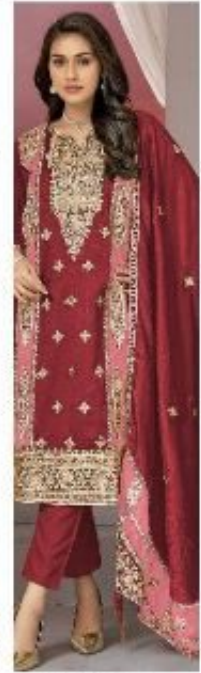
D.NO.168 - D