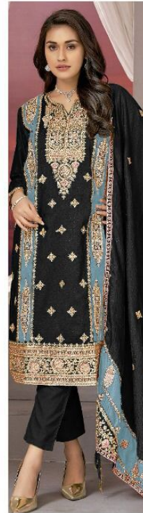
D.NO.168 - C