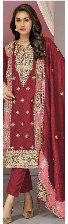
D.NO.168 - D