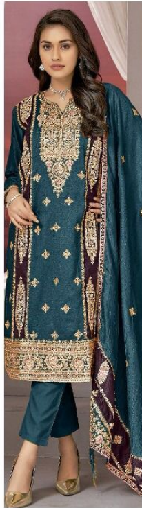
D.NO.168 - A