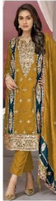
D.NO.168 - B