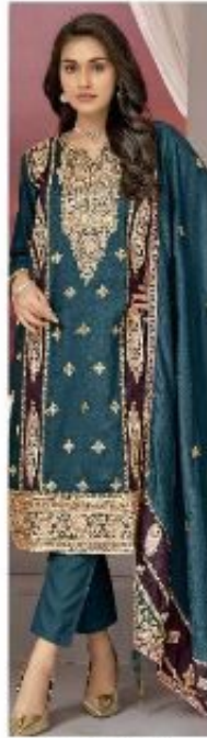
D.NO.168 - A