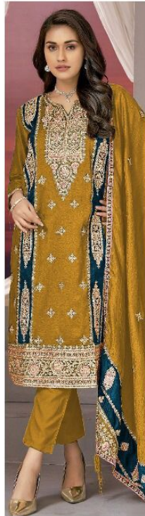
D.NO.168 - B