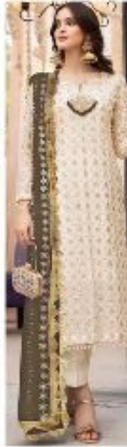
D.NO.170 - E