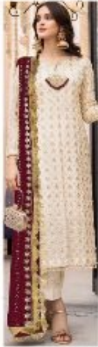
D.NO.170 - C