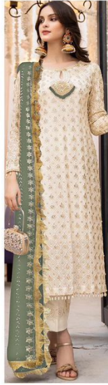
D.NO.170 - F