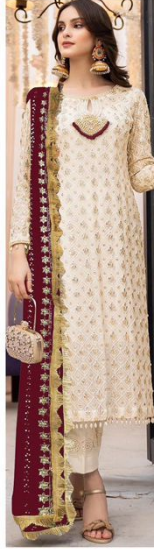
D.NO.170 - C