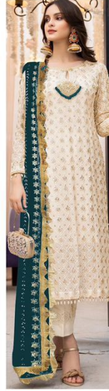
D.NO.170 - D