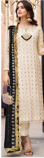
D.NO.170 - B