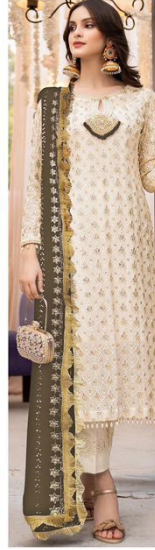
D.NO.170 - E