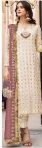
D.NO.170 - A