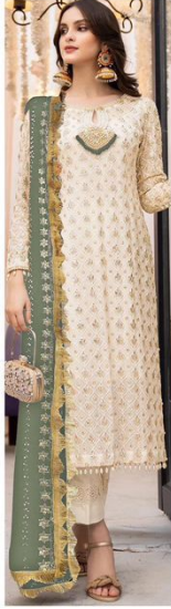
D.NO.170 - F