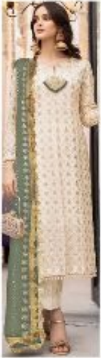
D.NO.170 - F