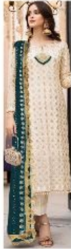
D.NO.170 - D