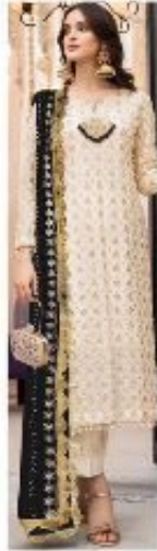
D.NO.170 - B