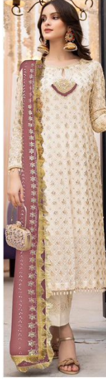
D.NO.170 - A