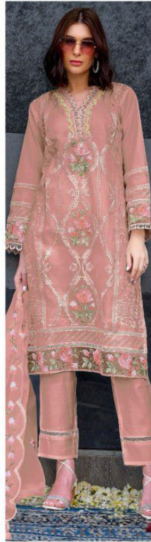
D.NO.177 - C