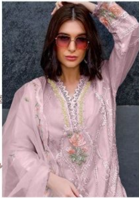
D.NO.177 - A

TOP - HEAVY ORANGE SILK WITH HEAVY EMBROIDERY WORK WITH ZIYAD WORK BOTTOM - DULL SANTOON DUPATTA - ORANGE SILK WITH EMBROIDERY WORK INNER - DULL SANTOON