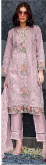
D.NO.177 - A

TOP - HEAVY ORANGENZA SILK WITH HEAVY EMBROIDERY WORK WITH DEMAND WORK BOTTOM - DULL SANTOON DUPATTA - ORANGENZA SILK WITH EMBROIDERY WORK INEER - DULL SANTOON