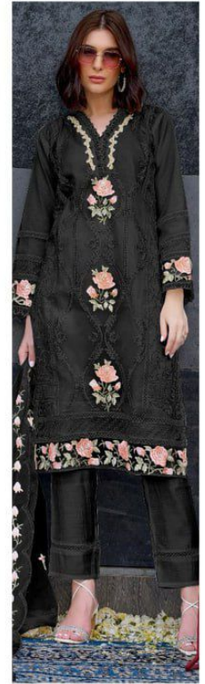
D.NO.177 - F