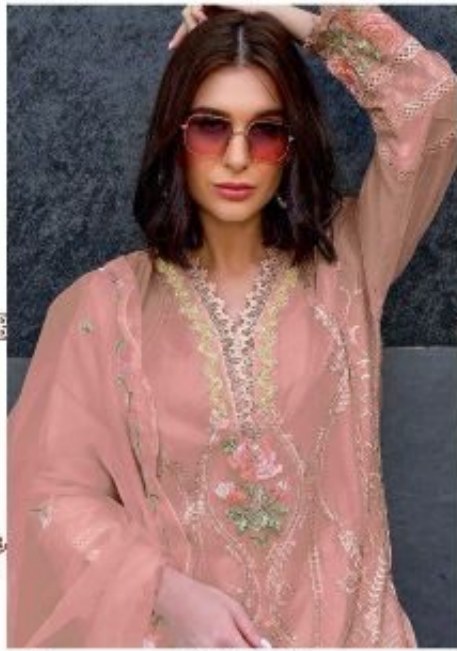
D.NO.177 - C

TOP - HEAVY ORANGE SILK WITH HEAVY EMBROIDERY WORK WITH ZIYAD WORK BOTTOM - DULL SANTOON DUPATTA - ORANGE SILK WITH EMBROIDERY WORK INNER - DULL SANTOON