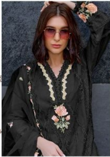
D.NO.177 - F

TOP - HEAVY ORANGE SILK WITH HEAVY EMBROIDERY WORK WITH ZINAB WORK BOTTOM - DULL SANTOON DUPATTA - ORANGE SILK WITH EMBROIDERY WORK INNER - DULL SANTOON