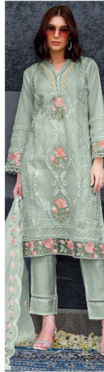
D.NO.177 - D