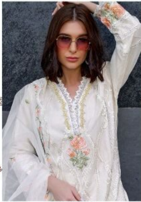
D.NO.177 - E

TOP - HEAVY DAANGUNZA SILK WITH HEAVY EMBROIDERY WORK WITH ZINAB WORK BOTTOM - DULL SANTOON DUPATTA - ORANGUNZA SILK WITH EMBROIDERY WORK INNER - DULL SANTOON