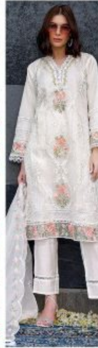
D.NO.177 - E