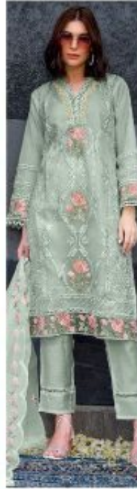
D.NO.177 - D