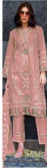
D.NO.177 - C