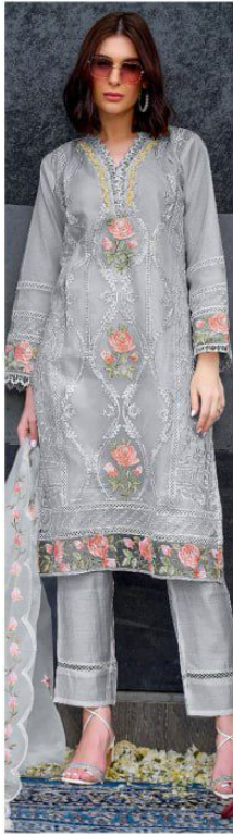
D.NO.177 - B