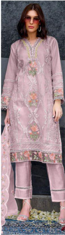
D.NO.177 - A