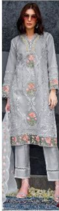
D.NO.177 - B