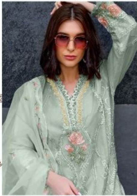
D.NO.177 - D

TOP - HEAVY ORANGE SILK WITH HEAVY EMBROIDERY WORK WITH ZINAB WORK BOTTOM - DULL SANTOON DUPATTA - ORANGE SILK WITH EMBROIDERY WORK INNER - DULL SANTOON