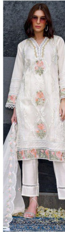
D.NO.177 - E