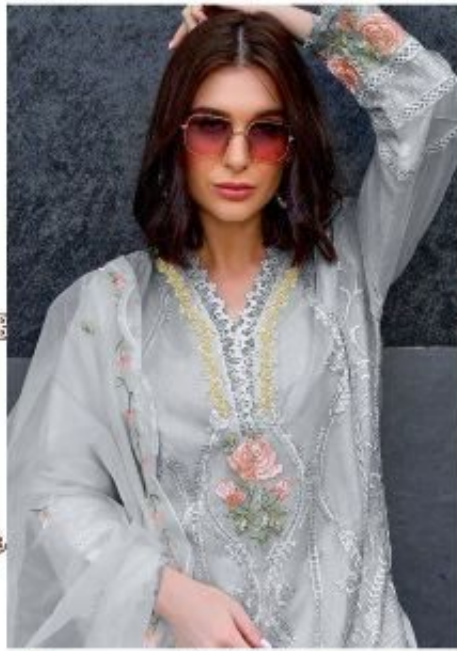
D.NO.177 - B

TOP - HEAVY ORANGE SILK WITH HEAVY EMBROIDERY WORK WITH ZIYAD WORK BOTTOM - DULL SANTOON DUPATTA - ORANGE SILK WITH EMBROIDERY WORK INNER - DULL SANTOON