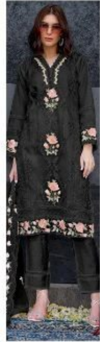
D.NO.177 - F