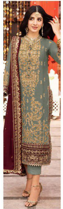
D.NO.179 - D