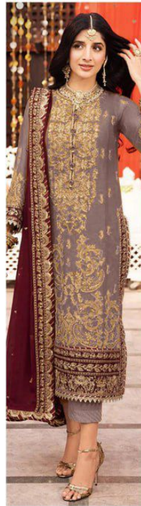
D.NO.179 - B