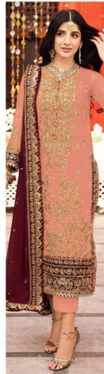
D.NO.179 - C