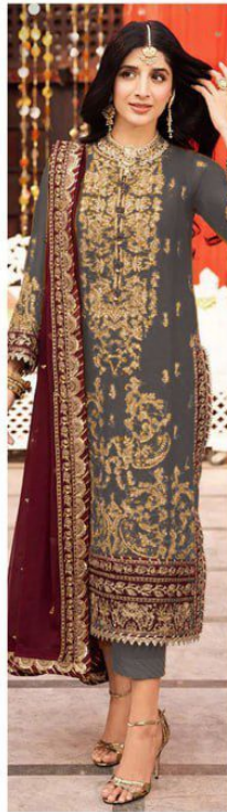
D.NO.179 - A