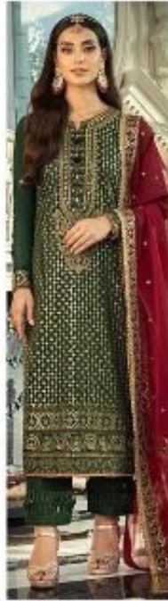
D.NO.174 - A