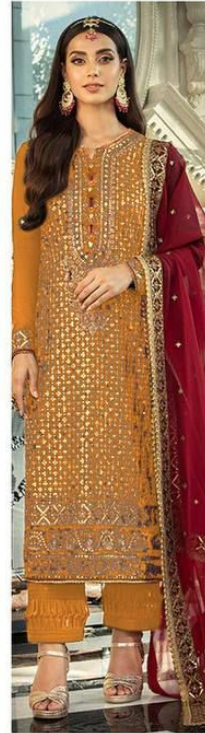
D.NO.174 - C