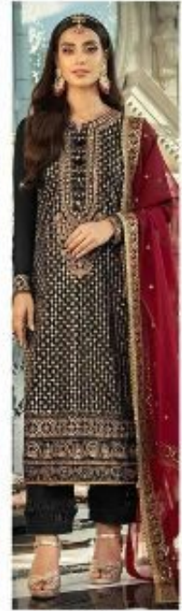
D.NO.174 - D