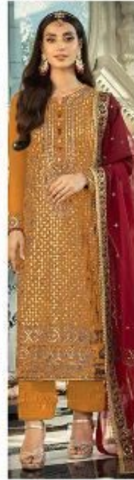
D.NO.174 - C