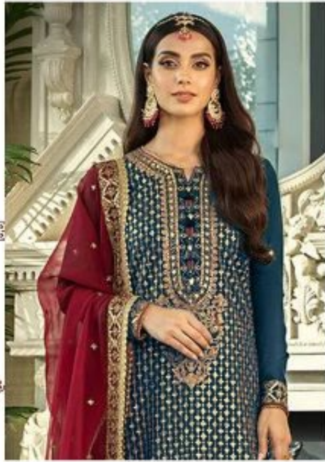
D.NO.174 - B

TOP - GEORGETTE WITH EMBROIDERY SEQUINCS WORK BOTTOM - DULL SANTOON DURRYA - GEORGETTE WITH EMBROIDERY WORK INNER - DULL SANTOON