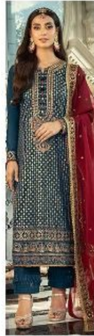
D.NO.174 - B