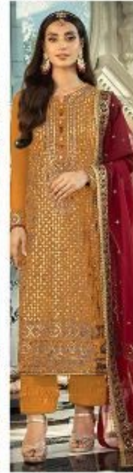
D.NO.174 - C