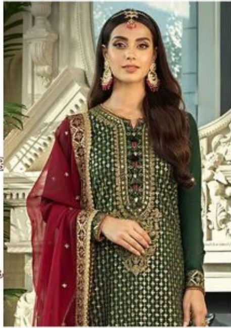
D.NO.174 - A

TOP - GEORGETTE WITH EMBROIDERY SEQUIN'S WORK BOTTOM - DULL SANTOON DURRYA - GEORGETTE WITH EMBROIDERY WORK INNER - DULL SANTOON