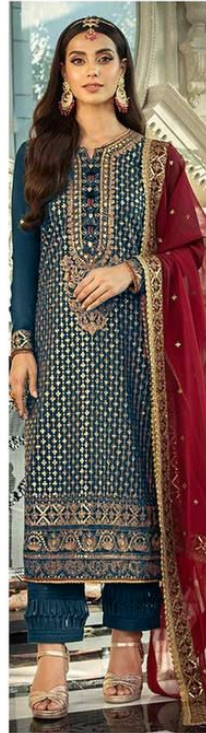
D.NO.174 - B