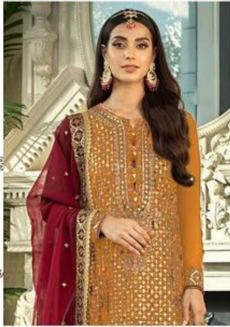
D.NO.174 - C

TOP - GEORGETTE WITH EMBROIDERY SEQUINCS WORK BOTTOM - DULL SANTOON DUPATA - GEORGETTE WITH EMBROIDERY WORK INNER - DULL SANTOON