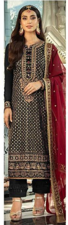
D.NO.174 - D