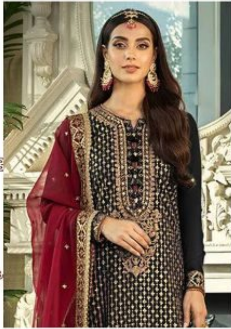
D.NO.174 - D

TOP - GEOMETTE WITH EMBROIDERY SEQUINCS WORK BOTTOM - DULL SANTOOM DURATA - GEOMETTE WITH EMBROIDERY WORK INNER - DULL SANTOOM