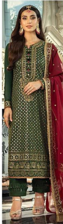
D.NO.174 - A