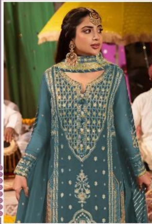
TOP - HEAVY GEORGETTE WITH HEAVY EMBROIDERY SEQUENCE WORK BOTTOM & INNER - DULL SANTOON DUPATTA - HEAVY GEORGETTE WITH EMBROIDERY WORK D.NO:-183-C