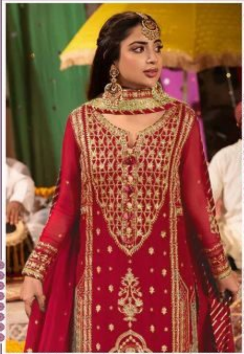
TOP - HEAVY GEORGETTE WITH HEAVY EMBROIDERY SEQUENCE WORK BOTTOM & INNER - DULL SANTOON DUPATTA - HEAVY GEORGETTE WITH EMBROIDERY WORK D.NO:-183-B