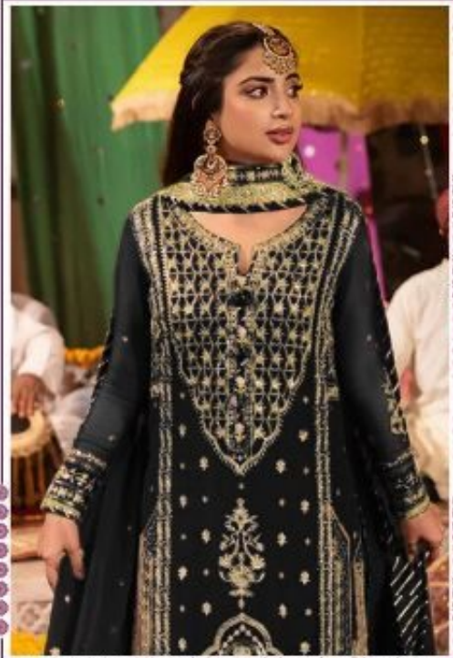
TOP - HEAVY GEORGETTE WITH HEAVY EMBROIDERY SEQUENCE WORK BOTTOM & INNER - DULL SANTOON DUPATTA - HEAVY GEORGETTE WITH EMBROIDERY WORK D.NO:-183-A